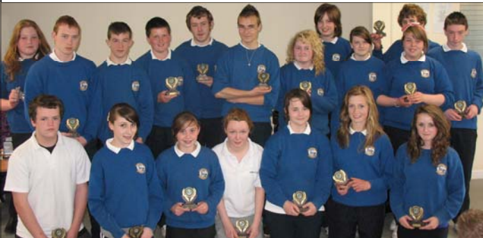
BUAITEOIRÍ LÁ SPÓIRT 2011 Winning Team