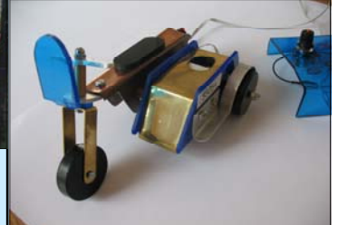
Eoin (3) Miotalóireacht

Students enjoying the G-Factor prize, valued at €1,700 - an activities day at DELPHI for 35 students. National finalists and provincial winners of Glór na nGael competition (see page 2)