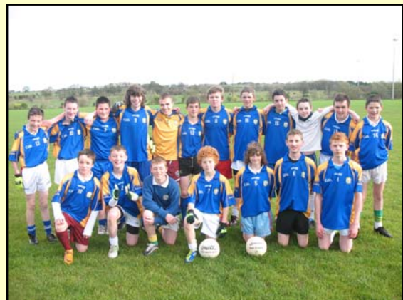
Coláiste Junior Football Team — full update on all sports in the next newsletter