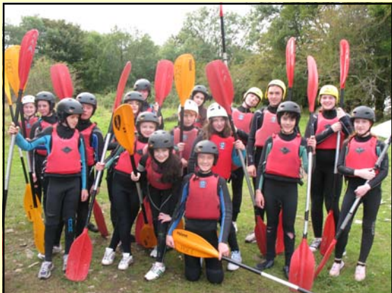
Bliain 1 — Turas to Petersburg Outdoor pursuits

For more reports, log on to Coláiste an Eachréidh and follow the link to Transition Year News