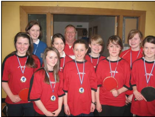
TABLE TENNIS— GIRLS PROVINCIAL CHAMPIONS 2010