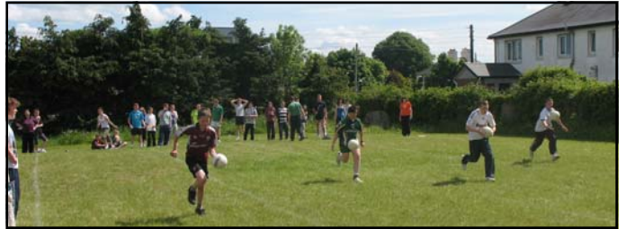
Bhí an fear thall gléasta! Ar chlé, na buachaillí sinsearacha (senior) sa rás 1500m. Thuas, some talented footballers running the first leg of a relay race.