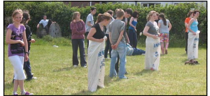
Na cailíní ag fanacht don rás-mála, rás-relay thíos